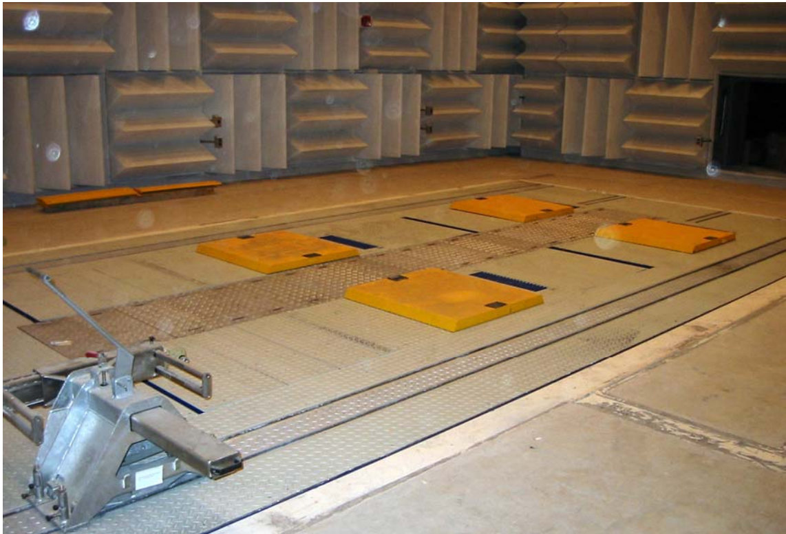
View of anechoic test chamber above isolated mass.