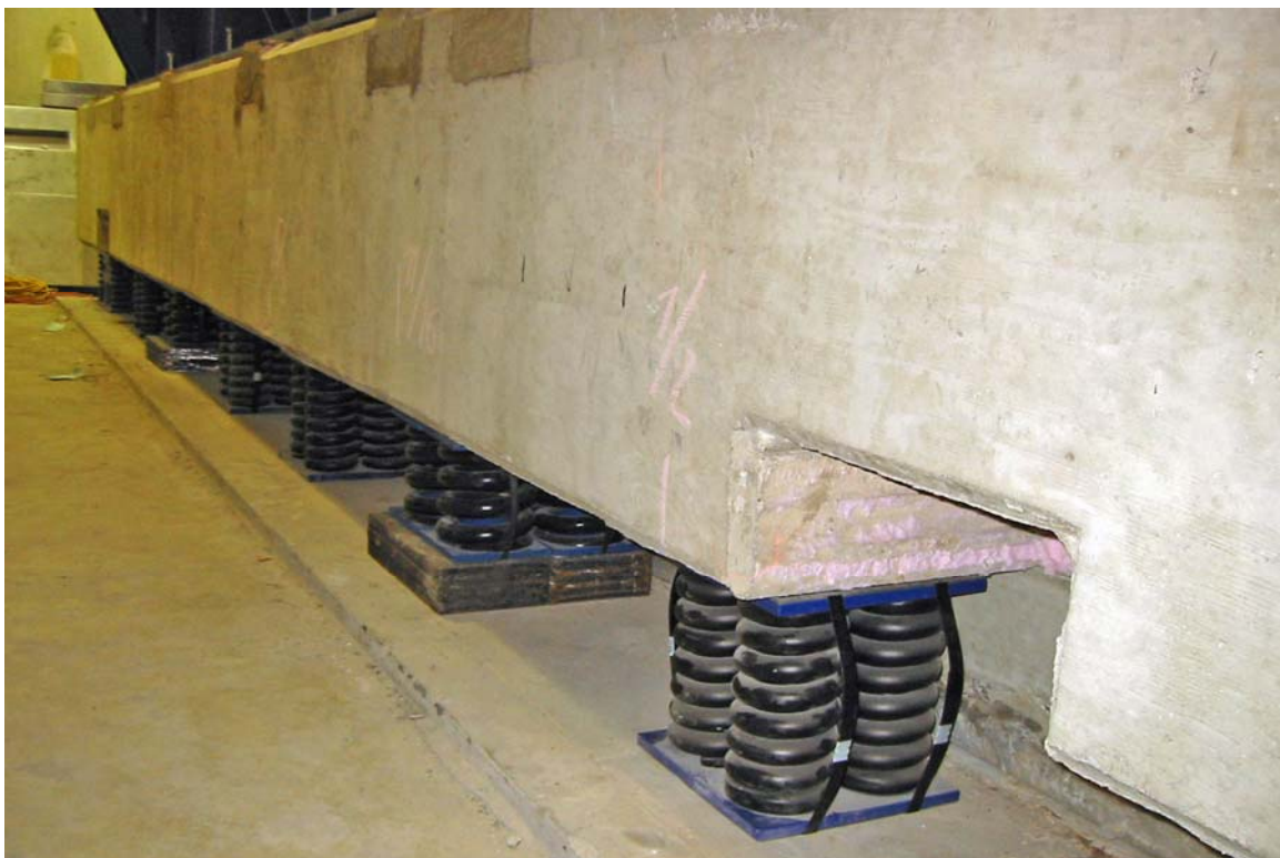
Sixteen (16) coil spring isolator units support the 201,000 Kg (442,200 lb) mass. Four pockets are designed into the mass for jacking/lifting the mass prior to the spring isolator installation.