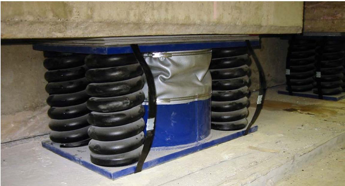
Four of the spring isolator units include viscous dampers, which provide damping for the system.