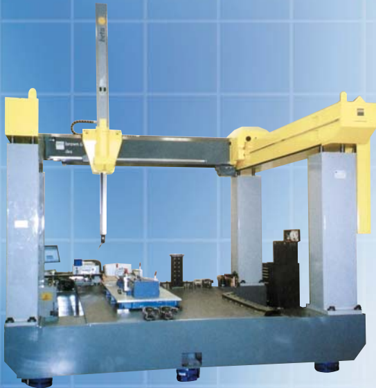
BETA SPM 33.20.15