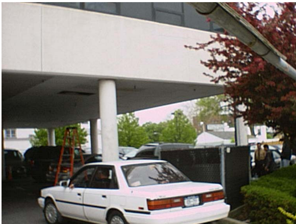
Access area to isolation system in parking garage. MRI unit is located on the second floor of the building.