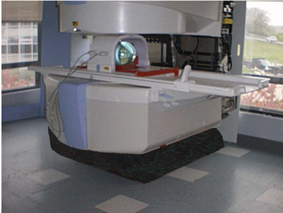
A sensitive magnetic resonance imaging (MRI) unit is isolated on a Fabreeka pneumatic isolation system.